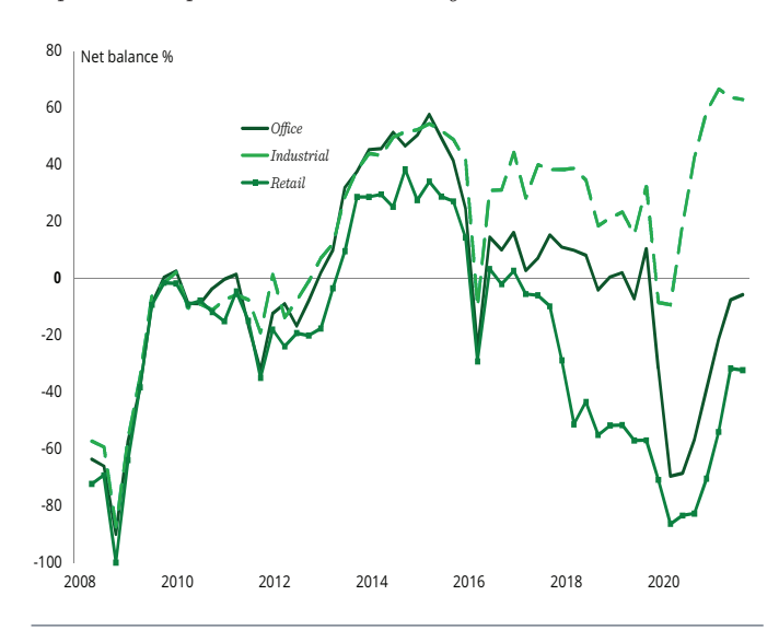
Capital \ value \ expectations - broken \ down \ by \ sector